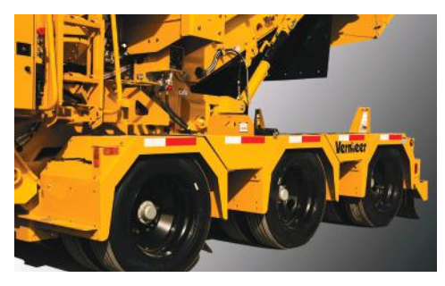
MOBILITY. The DT6 optional integrated dolly transport system eliminates the need for a dedicated trailer to move between sites.