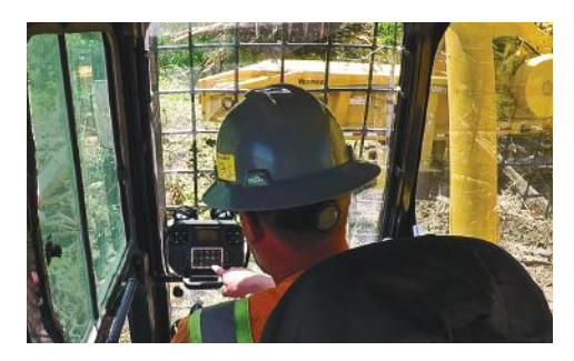
CONVENIENT CONTROL. The transceiver remote is equipped with the machine control menu, providing the ability to supply the user with machine-operating information to monitor the machine's health, and a fault log.