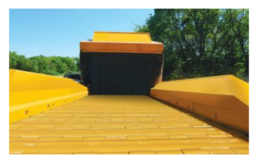
CONVENIENT FEEDING. The HG6800TX features low sidewalls to aid in feeding whole trees and other larger material with less restriction, reducing the number of user interactions with the material.