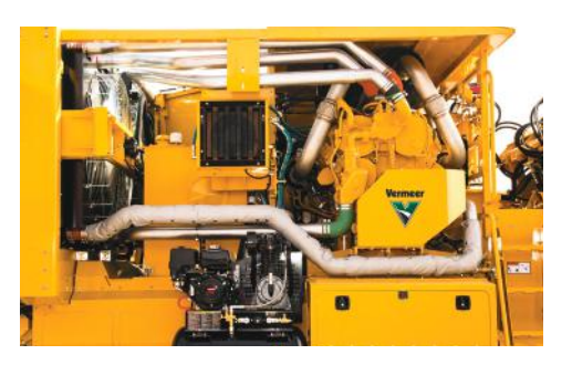
ENGINE HORSEPOWER. The dynamic combination of a high-horsepower engine on a machine boasting a compact design, results in a versatile horizontal grinder with high production capabilities.